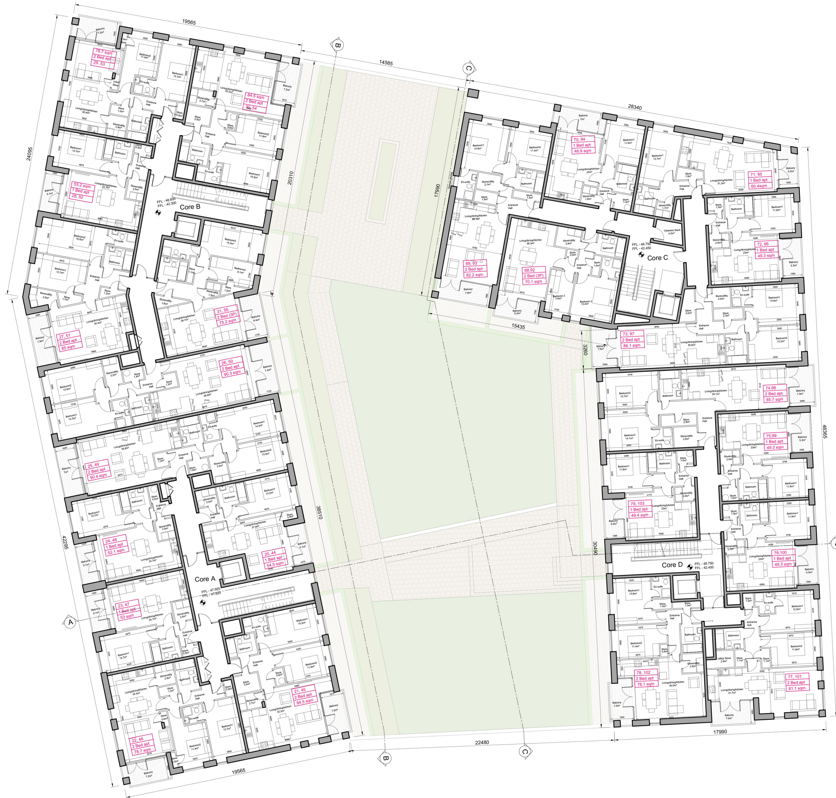
Second & Fourth Floor Plan