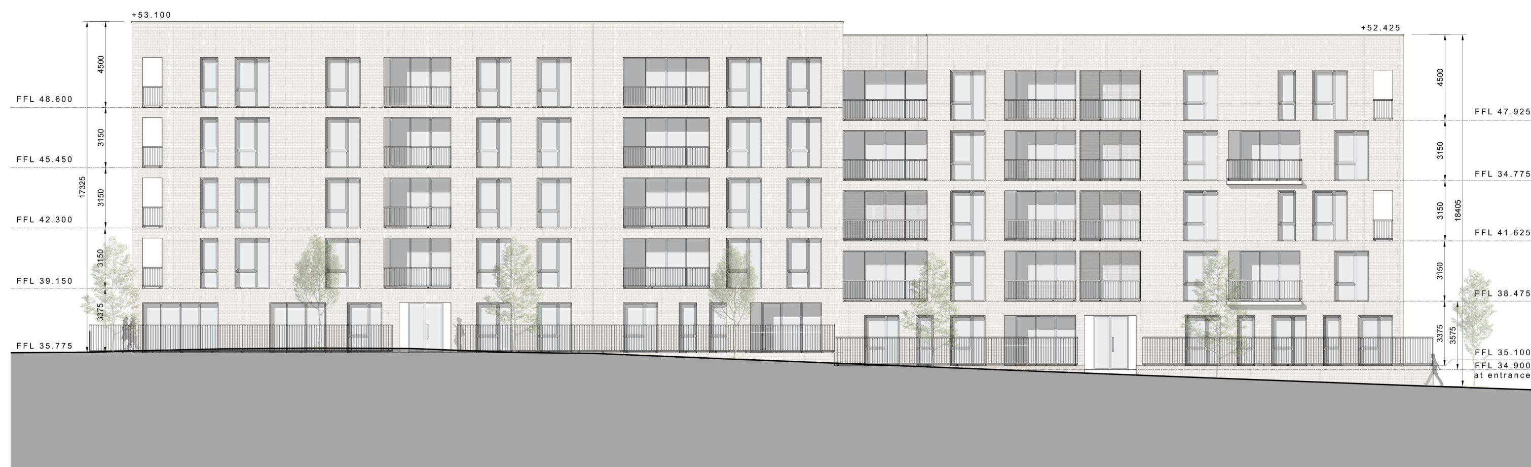
West Elevation - To Road