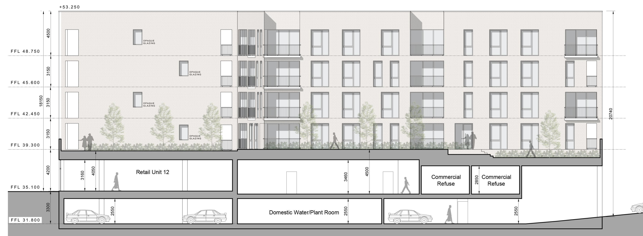
Section C:C with Internal East Elevation to Podium